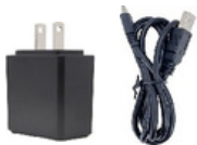
Fast charge adapter and CtoC data cable