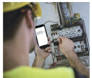
Electric Power Inspection