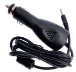
5V3A Car Charge